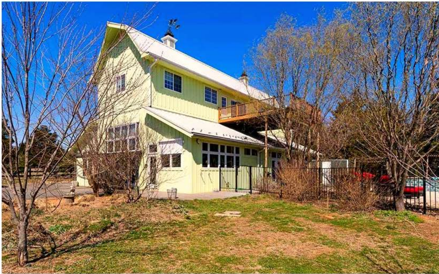
The Bed & Breakfast at Glass House Winery